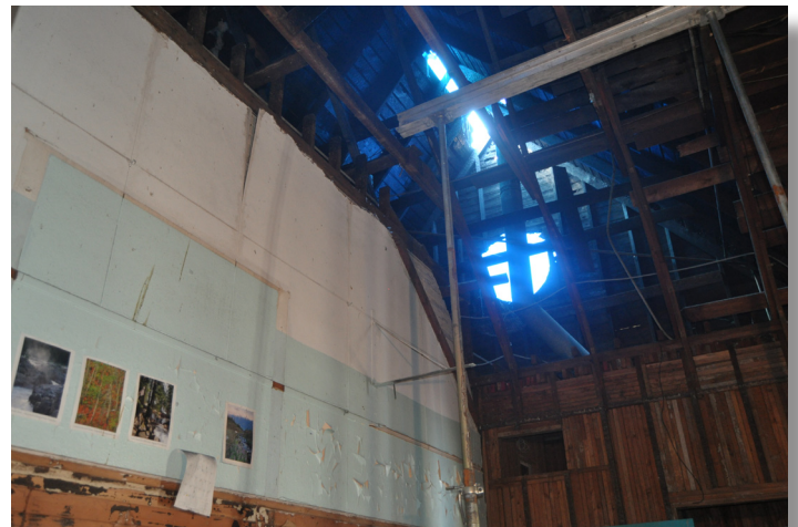
The interior of Carleton School House as it stands today.

Green Thumb Theatre urgently needs public and private financial support in order to build this legacy.